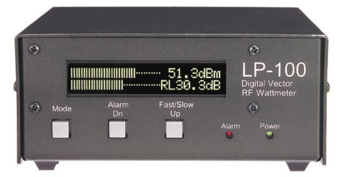
Figure 5 — The LP-100's front panel readout can display power in dBm and return loss in dB in addition to power in watts and SWR. In the vector mode, the display shows impedance. The top line is magnitude and phase, and the bottom line shows resistive and reactive components.